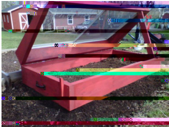
The cold frame lid should be hinged or allow for control of ventilation.

Every cold frame should have a means of ventilation. Ventilation is most critical in the late winter, early spring, and early fall on clear, sunny days when temperatures rise above 7°C. The glazed top should be propped up to allow excess heat to escape or removed entirely. Each day lower or replace the top early enough to conserve some heat for the night.